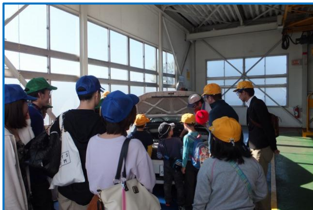
Nirayama plant tour. Participated children could study what products produced and job of parents.