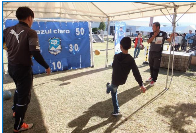
Kick target game by Azul claro. Many of children who like soccer came.