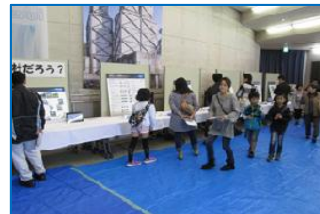
Products introduction. Explained USUI products clearly.