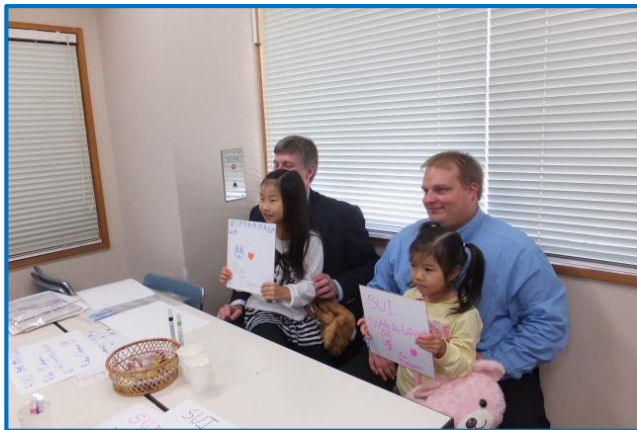
At international exchange space, children could communicate with members of overseas sites.