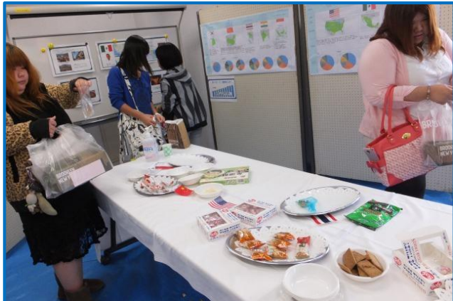
We could know how is the resident's life at overseas sites and try to sweets.