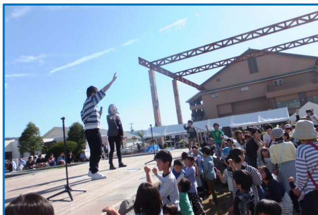
At the stage of Hidamari plaza, many events for children (Treasure-hunt game, Rock-paper-scissors tournament, etc.) were held.