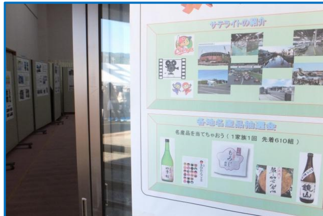
Lottery which held at introduction space of domestic sites provided us chance to get famous products of various places.