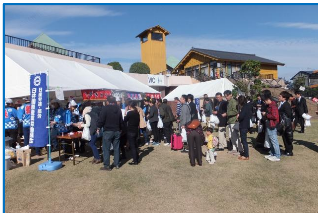
Food carts prepared by labor union. We could enjoy eating typical Japanese festival foods like Yakisoba, Takoyaki etc.