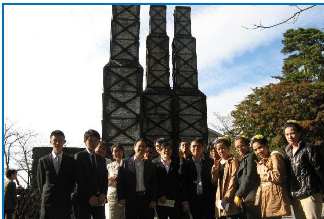
Nirayama reverberatory furnace (World heritage site). Visitors could study local history.