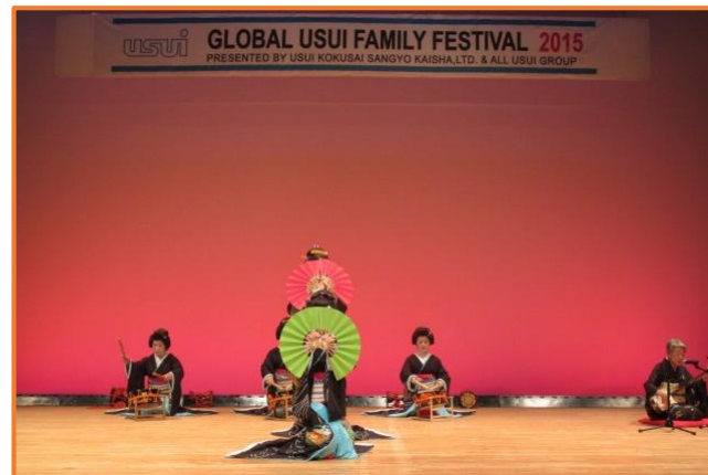
Japanese drum performance by Izu Sogou high school.