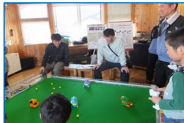
Soccer-robot game. Children deepen interest to technology through playing game.