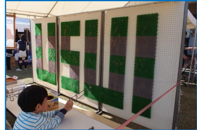
Making toy gun by using pipe bending jig.